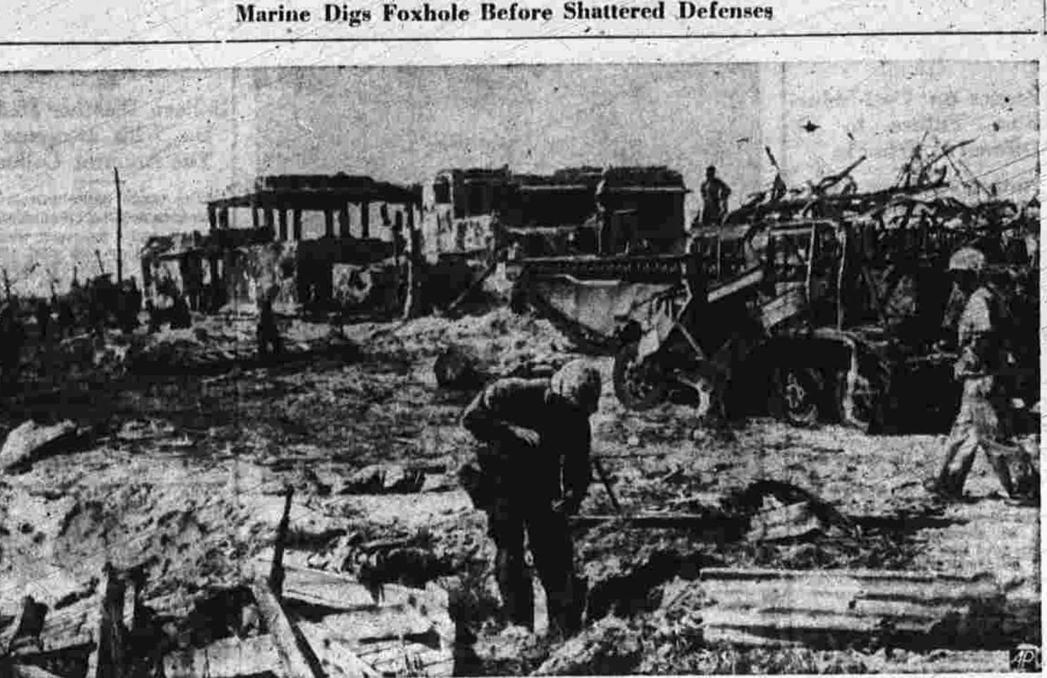
A United States Marine digs a foxhole on Namur Island as U. S. forces seized the Jap base in the Kwajalein atoll during the successful invasion of the Marshall Islands. Burned-out mechanized equipment and a shattered blockhouse are visible in the background. Other Marines move through the wreckage.

It is expected that the installation of officers elected tonight will be held in mid-March.